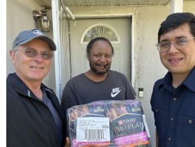
Rotary on the Road