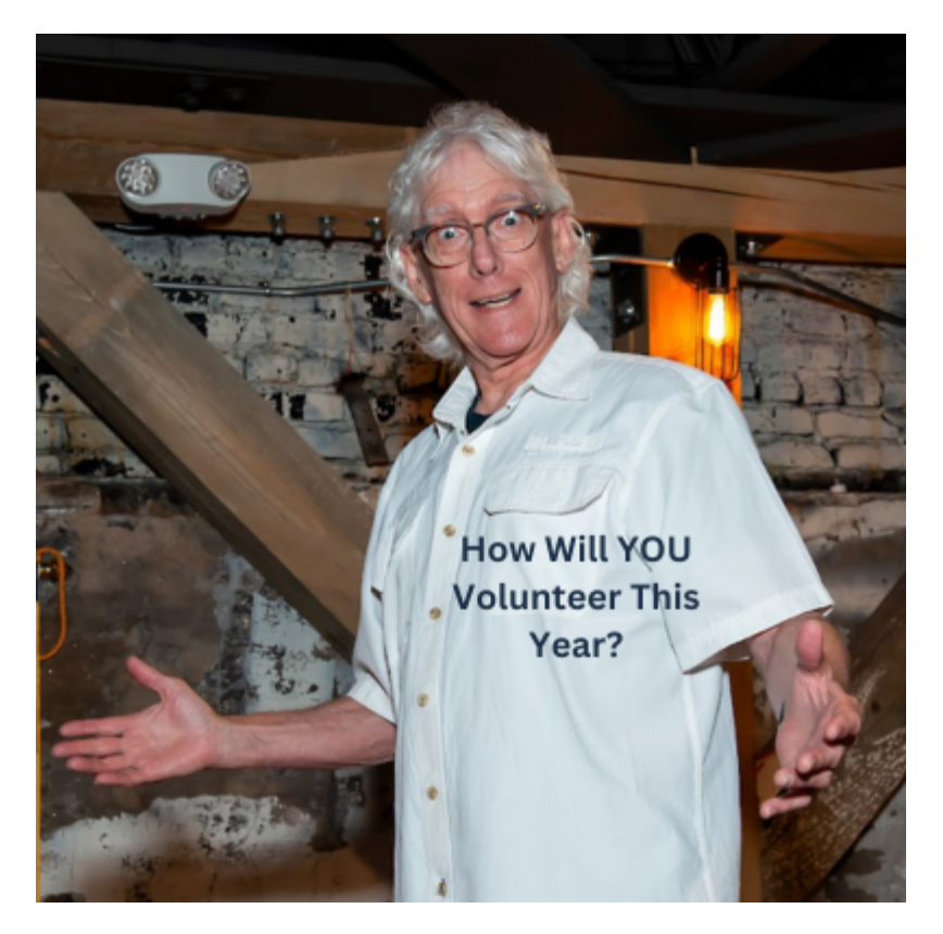
This is what earns Rotary such a great reputation...Service Above Self. Plan to attend many of these events...and think about bringing a friend or prospective new member. If you believe in Rotary's mission and recognize the value our club brings to our community and our world, then participate -- and share it with others!