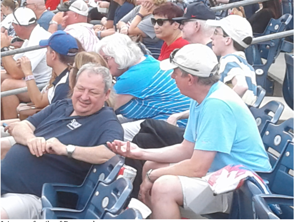
Join your family of Dunwoody:

• August 3- Take Me out to the Ballgame: Dinner (ballpark food) and a game