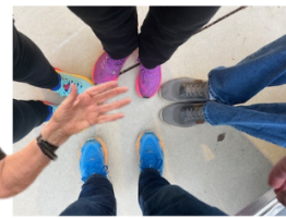
The Service Project Magician