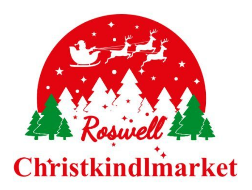
Nov 22-Dec 22 Volunteers needed at Bulloch Hall Gift Shoppe

It's that time of year- The Christkindle Market will be at Bulloch Hall Nov. 22- Dec. 22. Roswell Rotary is a partner in this endeavor along with Friends of Bulloch and we need your help! We are asking members (&/or spouses) to sign up to volunteer at the Bulloch Hall Gift Shoppe during the market. It's really easy and fun. To sign up,