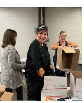
48 Awesome Packages!