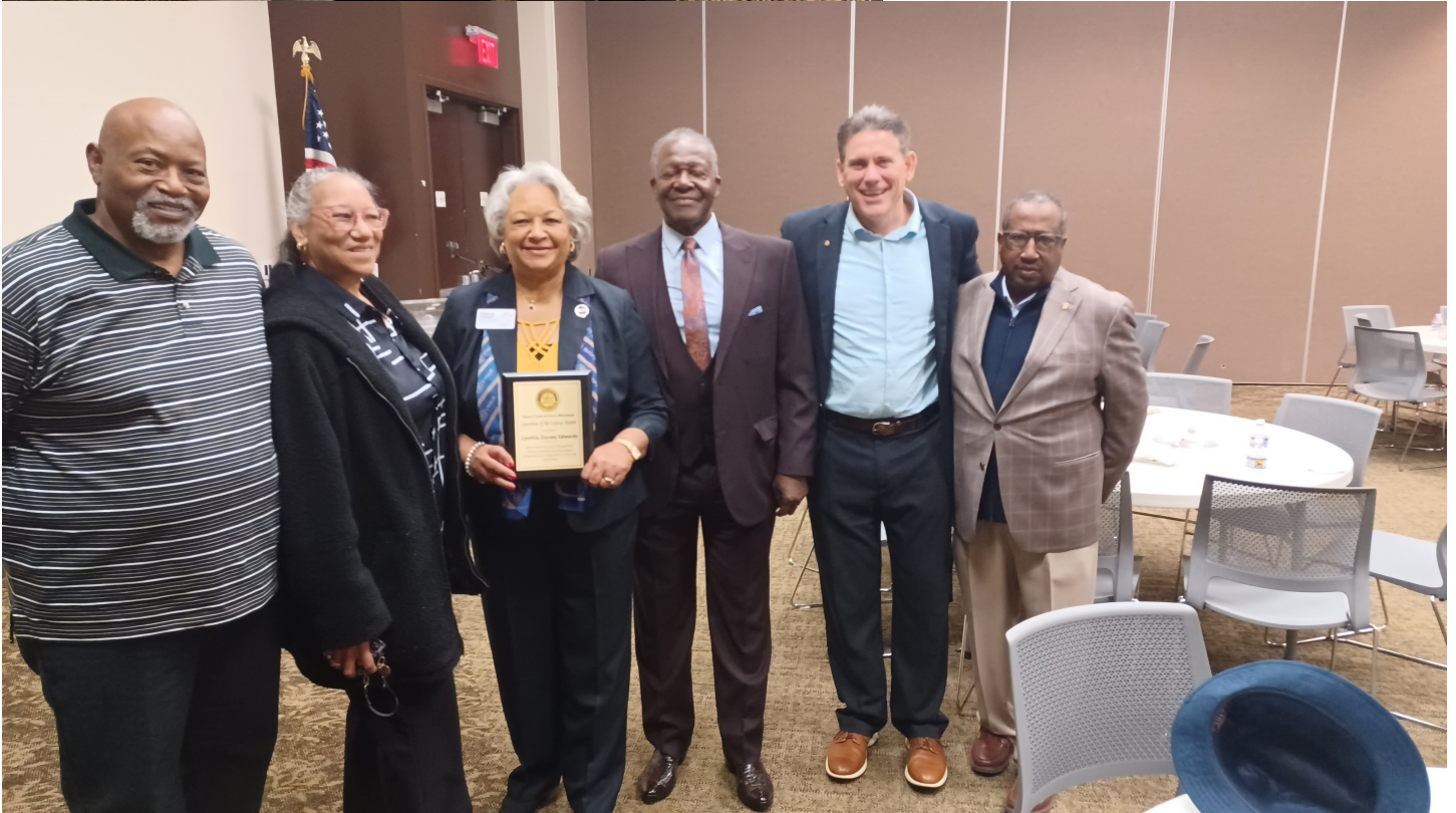
Posted by Darlene Daly April 2, 2025